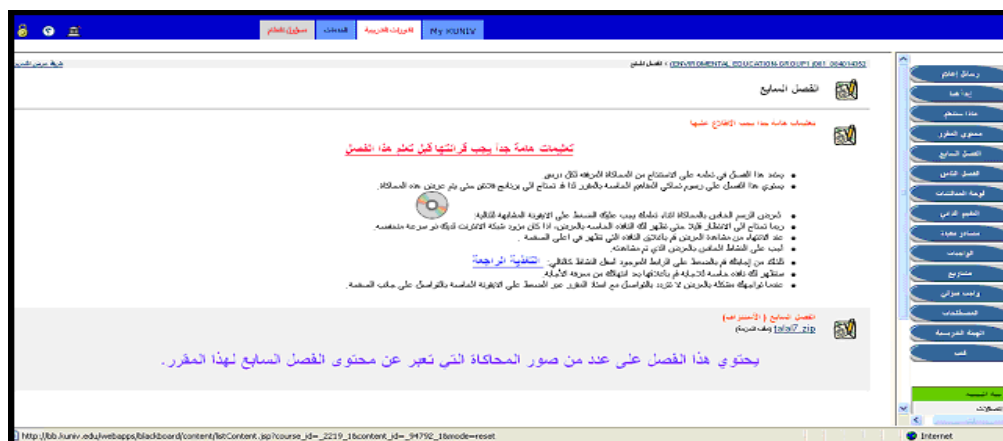
Figure 2. Window interface showing the manual of using chapter seven.