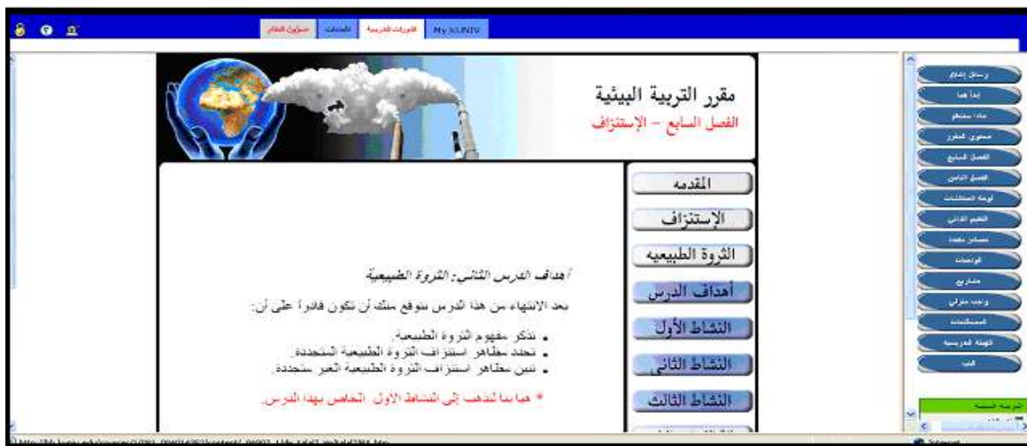
Figure 4. Goals of chapter seven.