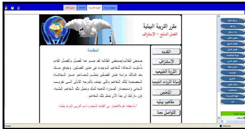
Figure 1. Introduction of chapter seven.